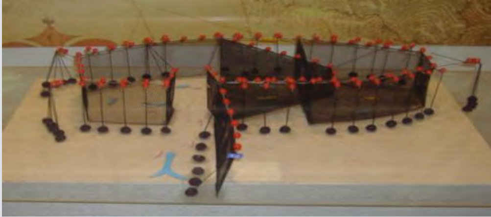
Model of a stationary fishing net showing construction, buoyage and anchoring

The buoyed and anchored stationary net construction is quite complex, as can be seen from the net model above. It can therefore be expected