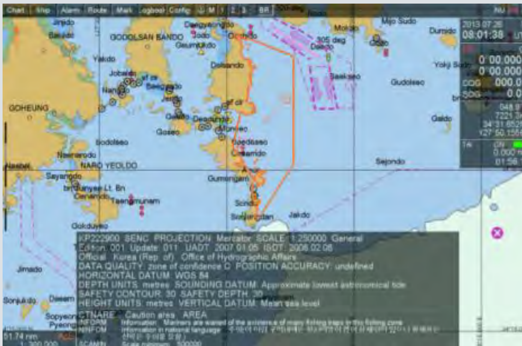
Chart extract showing the stationary fishing net area (orange border line) and the nearby vessel traffic zone

that if a vessel strikes a net, the repairs required will be extensive, costly and time consuming with resultant loss of fishing income.