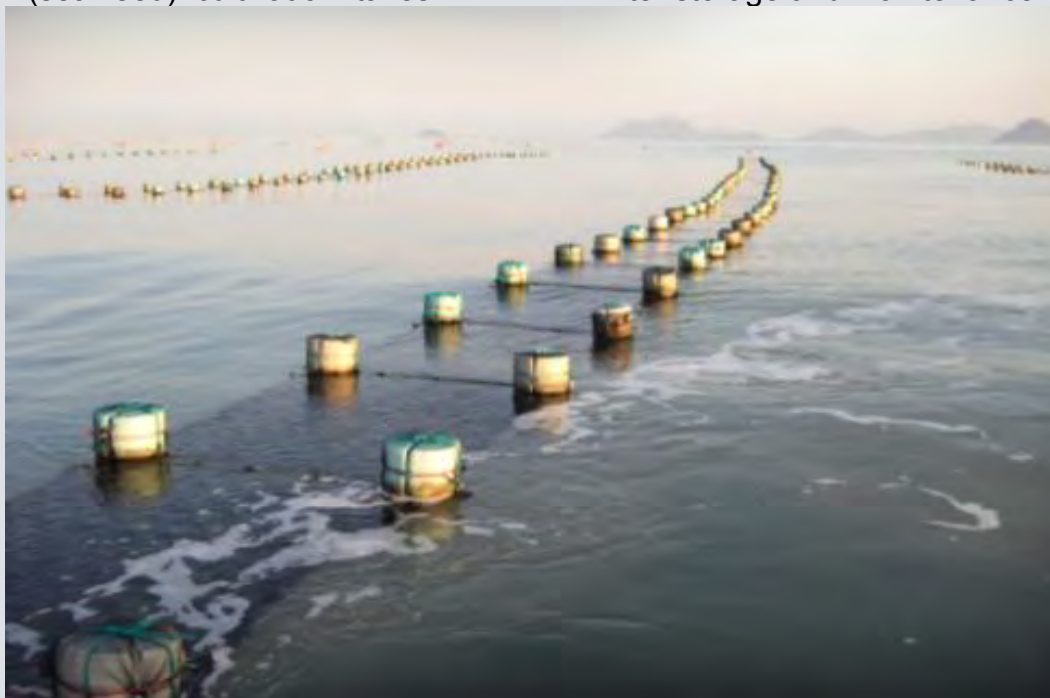
A typical laver net Chaek showing buoying, and netting

Below figure shows a typical laver facility with multiple rows of nets, buoys, rope connections and pillars which secure the nets to the sea bottom. The laver seed is implanted in September and harvesting then takes place every 20-30 days through to May. Once the last harvest is completed, the laver nets are dismantled and brought ashore for winter storage and maintenance.