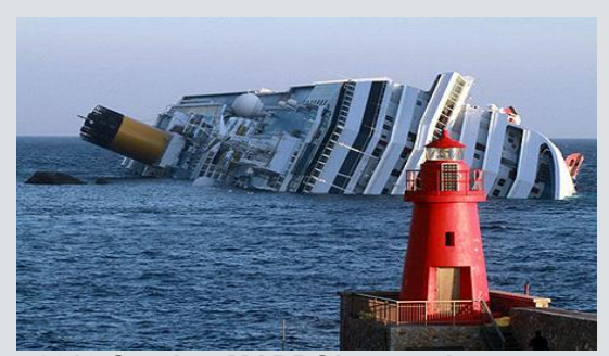
▶ 2010 October MARPOL amendments:

The amendments which entered into force on 1 January 2014 include a revised MARPOL Annex III Regulations for the prevention of pollution by harmful substances carried by sea in packaged form, to include changes to the Annex to coincide with the next update of the mandatory International Maritime Dangerous Goods (IMDG) Code, specifying that goods should be shipped in accordance with relevant provisions.