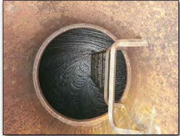
2- Entrained air / froth seen immediately following bunkering - ullage 171 cm