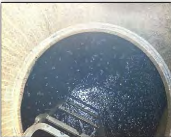
5- About 6 hours after bunkering - only light air bubbles seen - ullage 150 cm