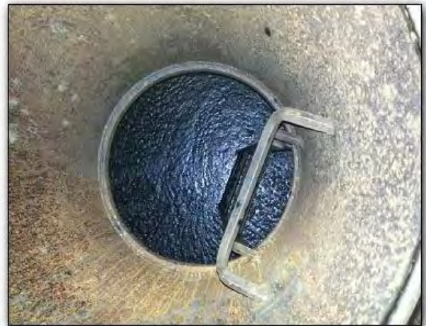
4- Two hours after bunkering - lot of bubbles seen