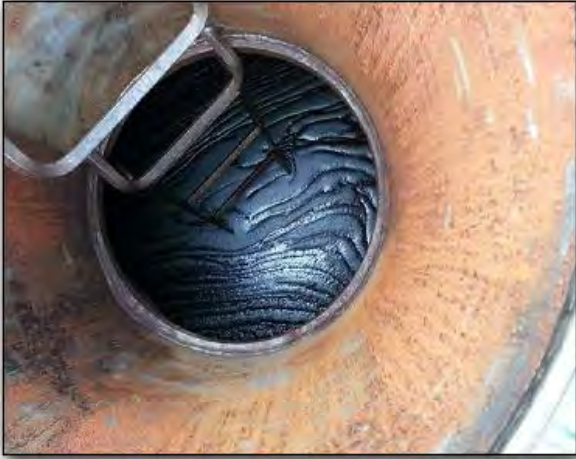
1- Entrained air / froth seen immediately following bunkering - ullage 139 cm