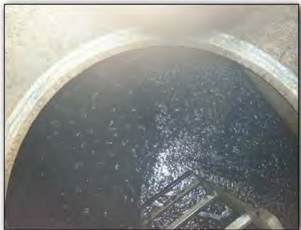
5- About 6 hours after bunkering - only light air bubbles seen - ullage 184 cm