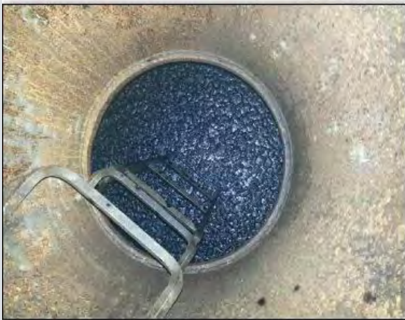
3- Two hours after bunkering - lot of bubbles seen