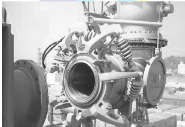
Hard arm quick connect/disconnect coupler (QCDC)

Terminals are also protected by careful risk analysis at the time of construction so helping to ensure that the location and size of maximum credible spill scenarios are identified, and that suitable precautions including appropriate safety distances are established between operational areas and local populations. Regarding shipping operations, risk analysis often identifies the cargo manifold as the area likely to produce the maximum credible spill. This should be controlled by a number of measures. Primarily, as for all large oil tankers, gas carriers should be held firmly in position whilst handling cargo, and mooring management should be of a high calibre. Mooring ropes should be well managed throughout loading and discharging. Safe mooring is often the subject of computerised mooring analysis, especially for new ships arriving at new ports, thus helping to ensure a sensible mooring array suited to the harshest conditions. The safe mooring principles attached to gas carriers are similar to those recommended for oil tankers. The need for such ships to be held firmly in position during cargo handling is due in part to the use of loading arms for cargo transfer. Such equipment is of limited reach in comparison to hoses, yet it provides the ultimate in robustness. It also provides simplicity in the connection at the cargo manifold.